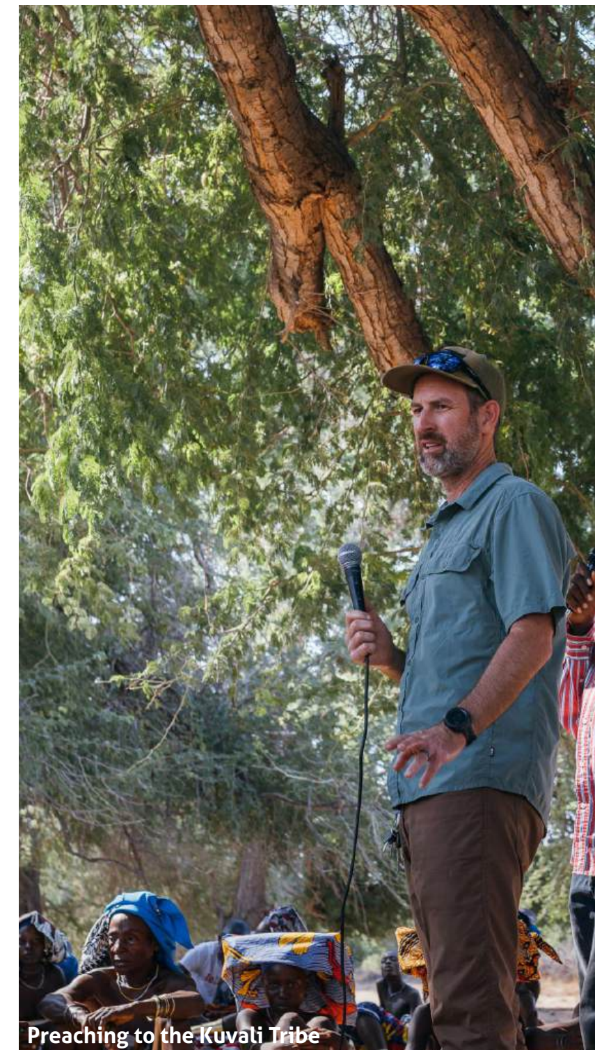
Preaching to the Kuvale Tribe

For 25 years, Overland Missions has been an organized and team-focused expression of ministry, and our goal remains