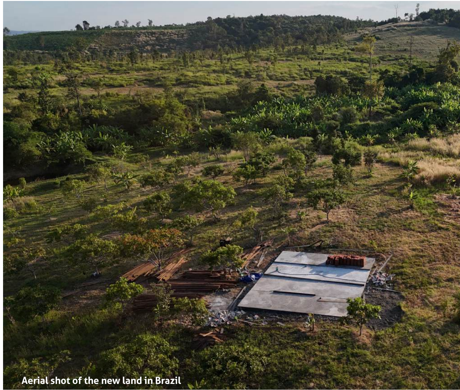
Aerial shot of the new land in Brazil