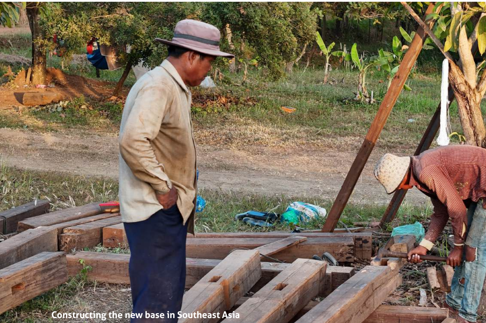
Constructing the new base in Southeast Asia

away from the ministry amongst the people. It was working, but they were craving more time availability to deepen the work.