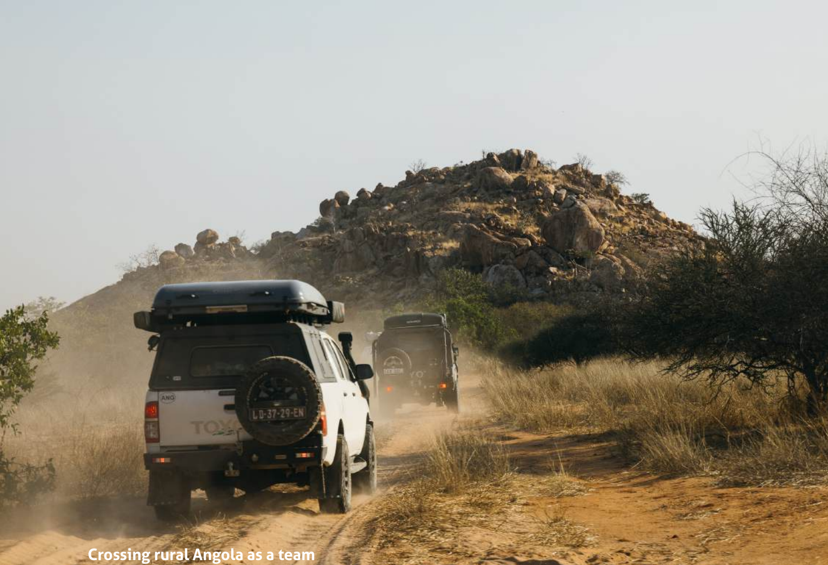
Crossing rural Angola as a team

In every place our feet touch, there is a need for solutionists who carry an answer to life's greatest questions. People groups across the world, many of whom have been unreached and neglected by the Church, are looking into our eyes and asking: "Do you have an answer to my pain? My sickness? My emptiness?" Our missionaries travel for hours, days and weeks to answer with a resounding, "Yes." Then, they proceed to spend their lives speaking the truth of God into the people and discipling those who desperately want Him.