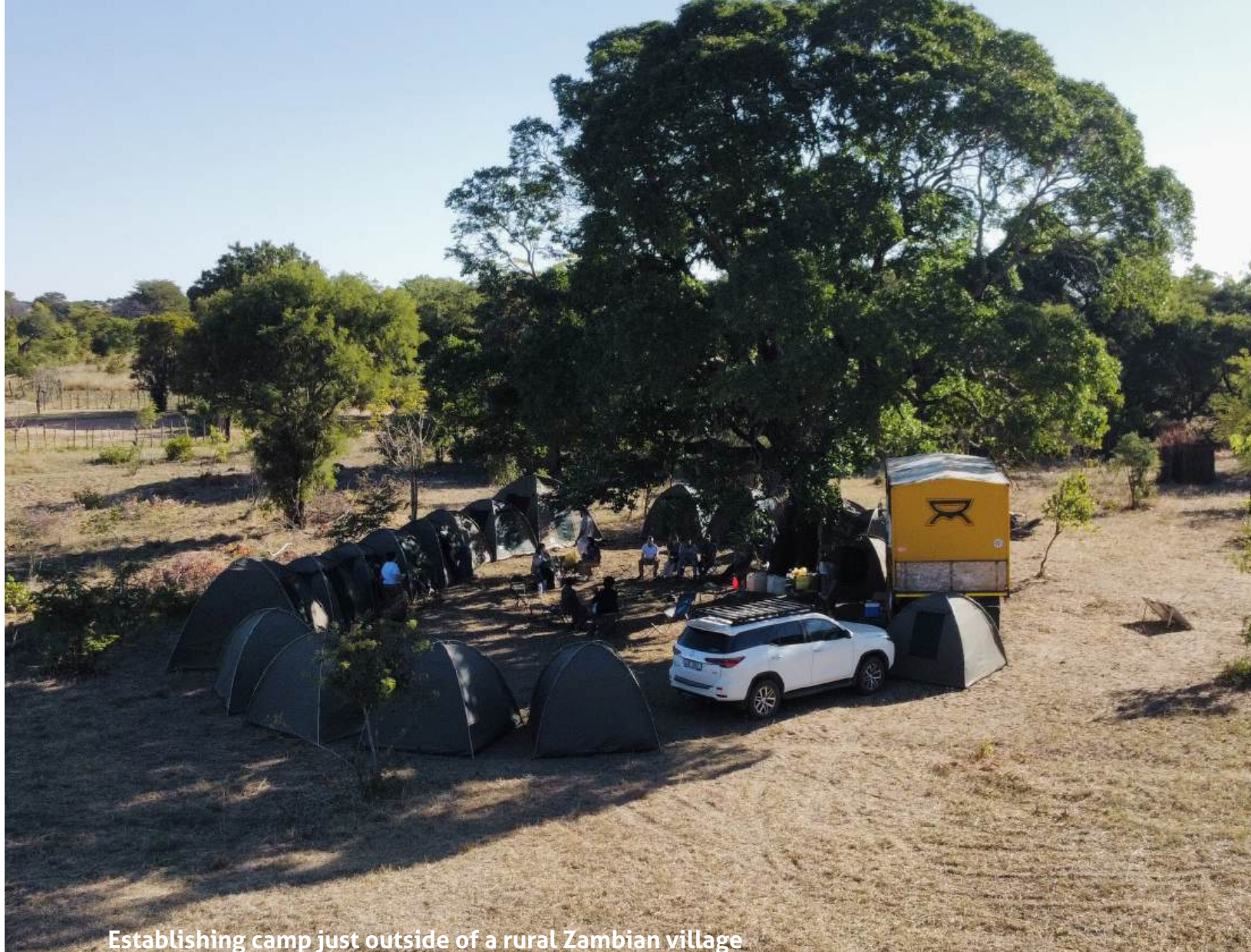
Establishing camp just outside of a rural Zambian village

Overland's expedition department is another example of growth born out of reliance on the Holy Spirit and hard work. The expedition leaders who staff the department are pioneering more unreached territory than ever before. This year we led 42 expedition trips into 14 nations, reaching a total of 25,000 people with a face-to-face presentation of the gospel. This is only the beginning of our reach within these countries and the move of God that awaits those who call them home.